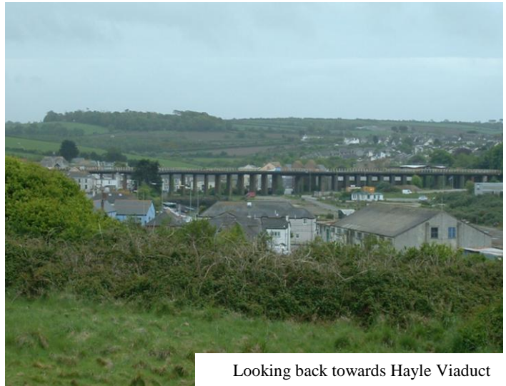
Looking back towards Hayle Viaduct

As you follow the path around it leads to an information plaque mounted on a stone plinth above another old gun emplacement which also marks the boundary between Harvey's Towans and Mexico Towans. Cross over the stepped path which leads from the caravan park to the sea and walk inland towards the waymark post on the horizon. At the waymark post turn slightly left to follow the obvious path across the Towans.