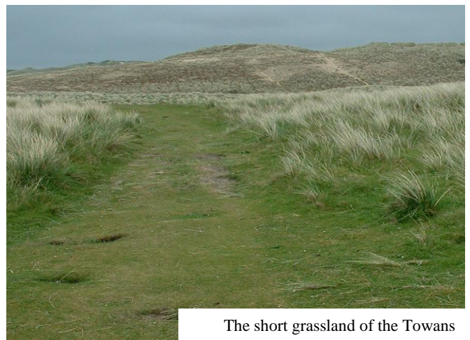
The short grassland of the Towans