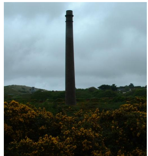
The chimney at Dynamite Towans