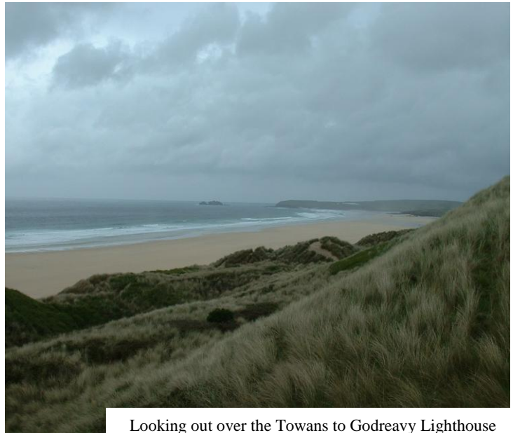
Looking out over the Towans to Godreavy Lighthouse

Follow the path down into the valley. In the bottom of the valley you will come to a cinder track. Turn right onto the track and follow it as it leads away from the sea. The track widens as it gets further from the sea and rises and turns left under the overhead powerlines. Follow the path around and towards the chimney of the Explosive Works. At the chimney turn right and then right again at the metal gate to follow the path down behind the houses of Upton Towans. Follow the path around and right and make towards the lay-by on Hayle-Gwithian road.